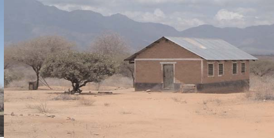
93 boys currently sleep in this dormitory on the cement floor with no facilities