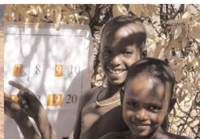
Learning to read and write in the pre-school