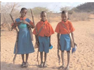
Primary school students going to school